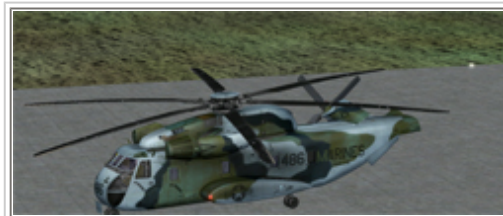
Notice the white tail light has stayed put after folding the tail.

The model of the CH-53A Sea Stallion is well done. I enjoyed the detailed work that went into it. That said, there were some issues with the tail lights. When you fold the tail, it folds properly up against the rear fuselage, but the main rotor blades do not fold. That alone is not a huge problem, unless you are like me and are trying to make room on a carrier deck for other landing aircraft and you want to take up as little space as possible. It also detracts from the realism of the product. Also when the tail folds, if you leave the lights on, the lights stay put.