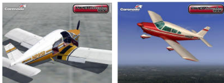
Clear and precise details everywhere!