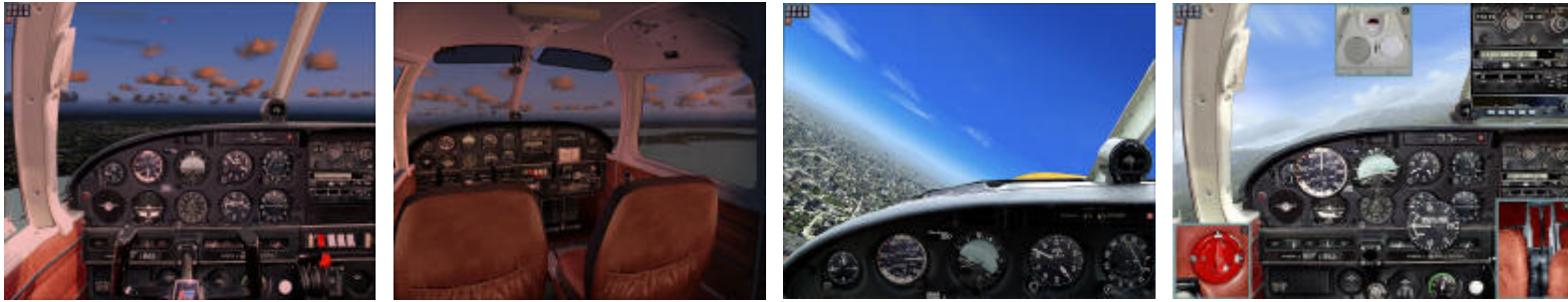
Highly detailed cockpit adds to the reality of this package